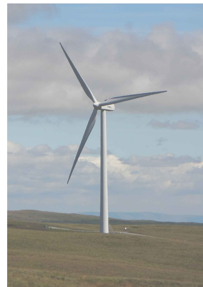
PHOTOGRAPH OF TYPICAL TURBINE